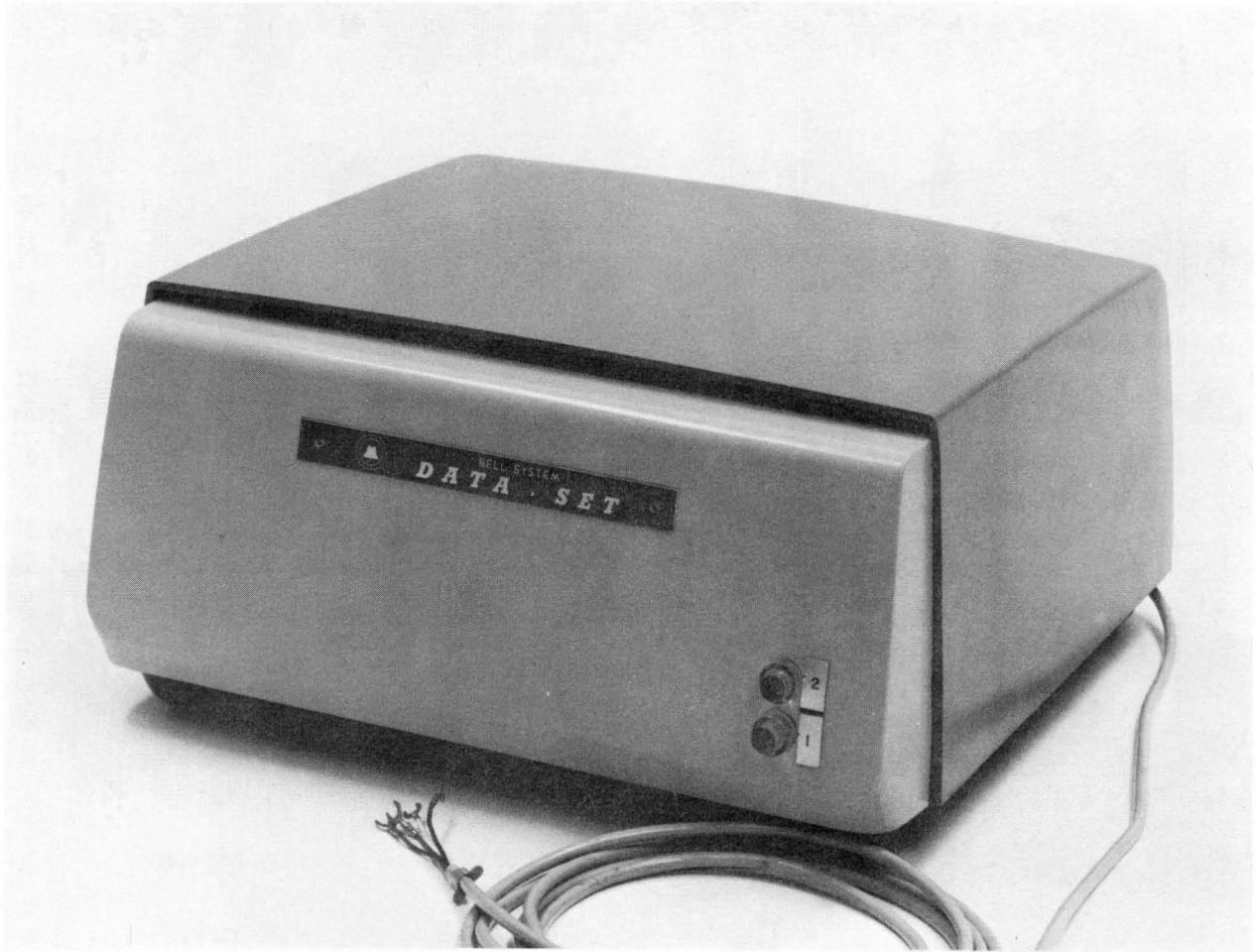
Fig. 1 – Data Set 103F